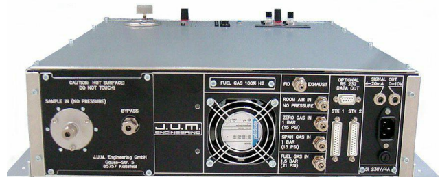
Rear View, Standard Configuration

J.U.M.® Engineering G.m.b.H. R&D and Manufacturing Gauss-Str. 5 D-85757 Karlsfeld, Germany Tel.: 49-(0)8131-50416, Fax: 49-(0)8131-98894 E-mail: info@jum.com, Internet: http://www.jum.com